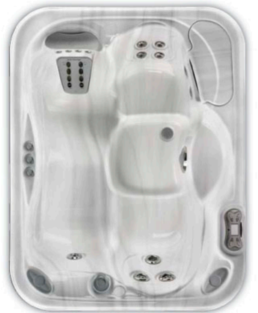
Jetsetter spa shell shown in Sterling Marble

*Includes water and 3 adults weighing 175 lbs. each ** G.F.C.I. protected sub-panel required in 230v mode Export models available in 230v, 50 Hz, 1500w Heater Also available in the Classic® Series (with white Enduro® spa shell). See your dealer for details.